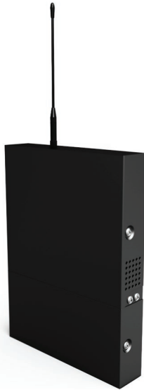
SMA 1000 Repeater

Sapling offers two repeater models for the wireless clock system – the Wireless Network Repeater (SMA-1SM) and the Wireless Repeater (SMA-1SR). This brochure explains the differences between the two types of repeaters, and when repeaters might be needed with the Sapling Wireless Clock System.