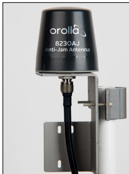
Model 8230AJ GPS/GNSS Anti Jam Outdoor Antenna with optional PVC Pipe (Model 8235) and optional Rugged Post Mount (Model ANT-KT)