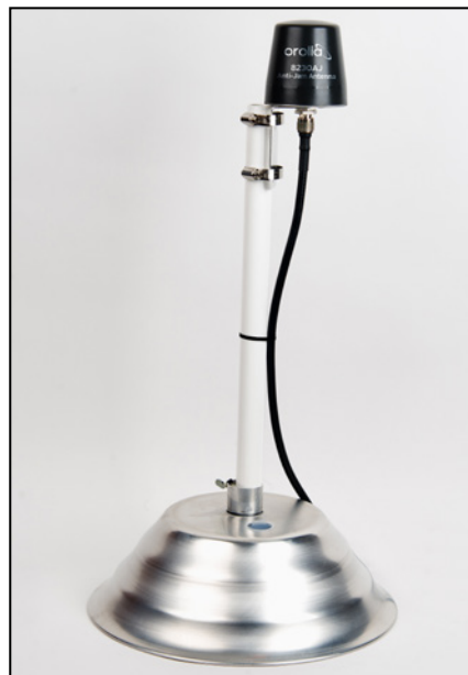
Model 8230AJ GPS/GNSS Anti Jam Outdoor Antenna with optional PVC Pipe (Model 8235) and optional Flat Roof Mount (Model 8213)